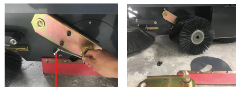
Main Brush Adjusting Screw